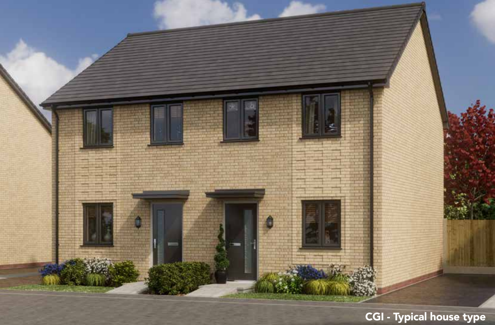
CGI - Typical house type