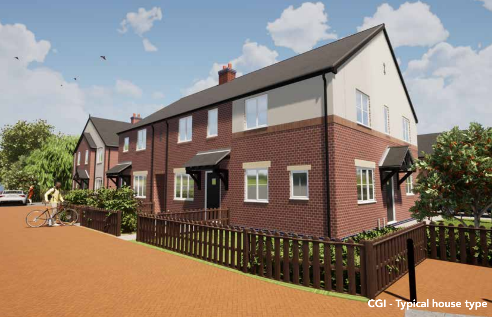
CGI - Typical house type