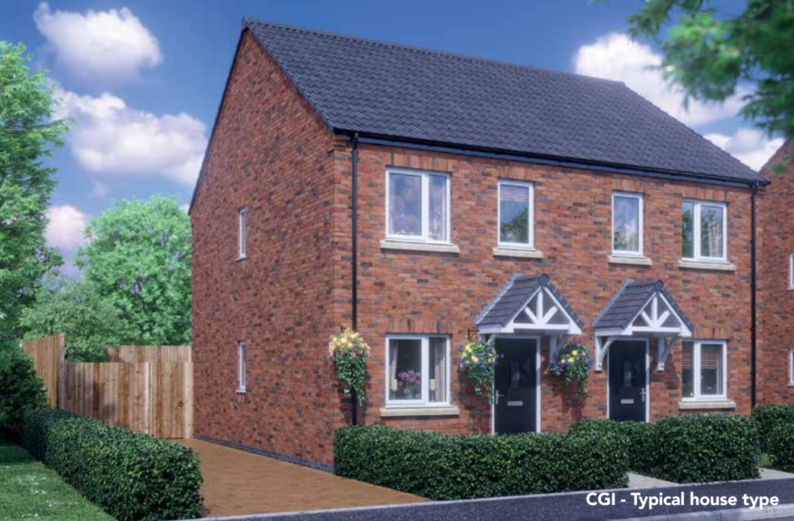
CGI - Typical house type